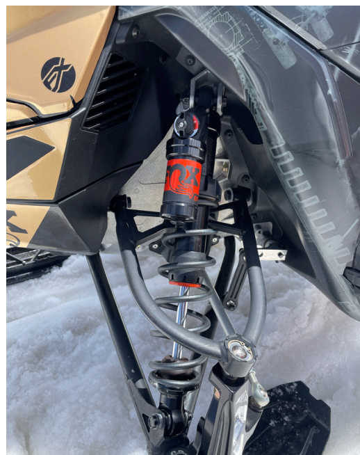
Fig. 1: Summit application (left side shown)

Mount your FOX shocks as illustrated in this guide. Reference the left/right decals shown in Figure 2 for proper placement. See the manufacturer's workshop manual for proper procedures. Torque all fasteners to the manufacturer's specifications.